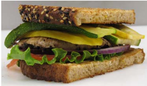
The California- Grilled Zucchini, Squash & Portabella Mushrooms topped w/Provolone & a Whole Grain Tarragon Mustard on Multi Grain