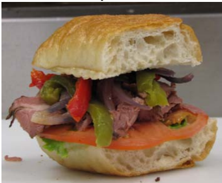
The Fajita - Roast Beef, Sautéed Red & Green Peppers, Onions & Chipotle Sauce on Ciabatta Bread. 10 16