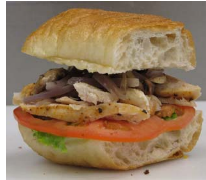
The Monterey Sandwich- Grilled Chicken topped w/Pepper Jack Cheese, Sauteed Onions & Mushrooms drizzled w/an Adobo Mayo on Cibatta