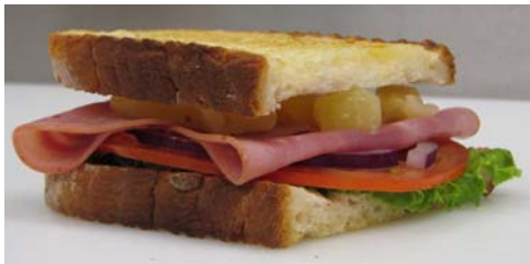
The Calypso- Shaved Ham & Grilled Pineapple, topped w/a Mango & Chipotle Cheese Spread on Sourdough Bread