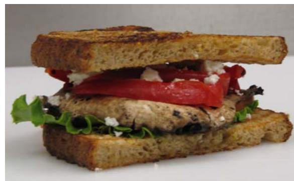
The Greek - Grilled Portobello, Roasted Red Pepper, Feta Cheese & Basil Pest on Multigrain Bread. 5 16