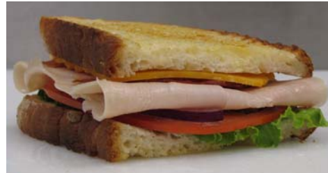
The Palfy-Sided w/Crisp Bacon & Asiago Peppercorn Mayo on Sourdough