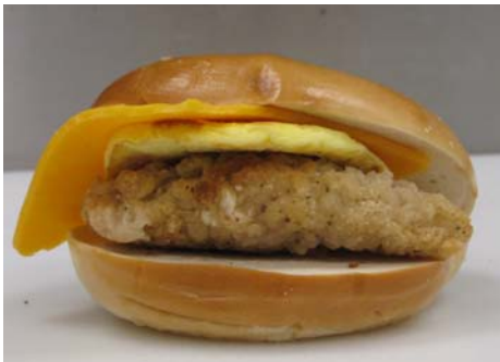
Plain w/Chicken, Egg & Cheese