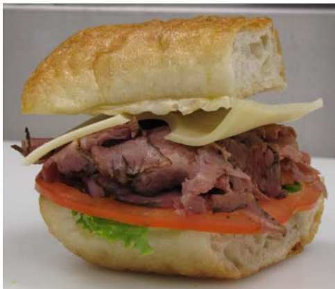
The Erk- Candied Pecans & Horseradish Sour Cream on a Ciabatta Roll