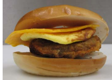
Plain w/Steak, Egg & Cheese