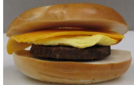
Plain w/Sausage, Egg & Cheese